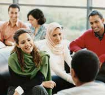
Compliance Through Care Culture