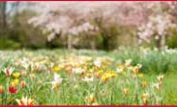
Understanding Tier 4 Visa Sponsorship